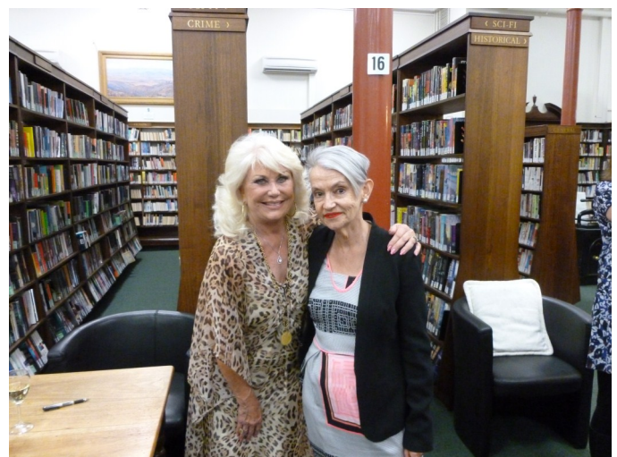
Di Morrissey visited the Library in October and talked about her novel "The Golden Land".