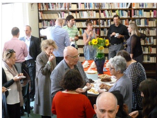
Book Launch Kitchen Table Memoirs