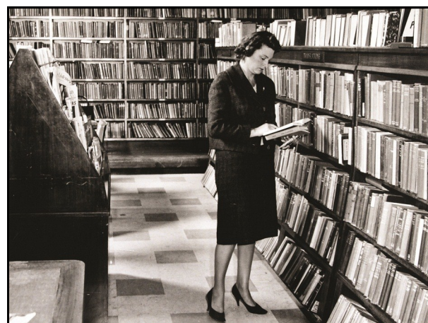
Browsing the shelves —1962