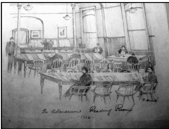
The Reading Room by Clifford Orme

The Melbourne Athenaeum, with its focus on theatre, literature and the arts, has truly reflected the development of Melbourne as a cultural centre, and grown and changed with the times.